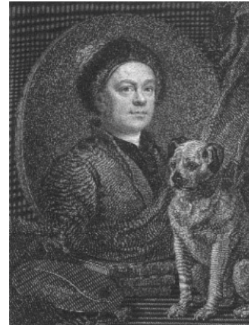
This is his print :