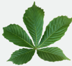
A horse chestnut tree

When outside, look out for leaves. Can you spot...?