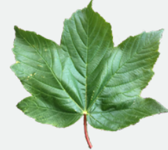
A sycamore tree