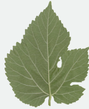
A mulberry tree